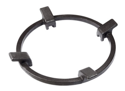
Cast iron wok support 9601 727